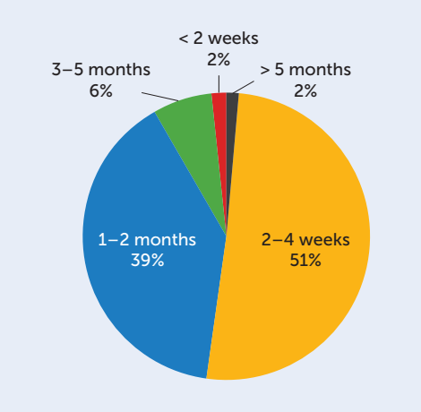
Figure 2: Average Time between Submitting Claim and Reimbursement Received

Results from difference-in-difference models, * p < 0.05